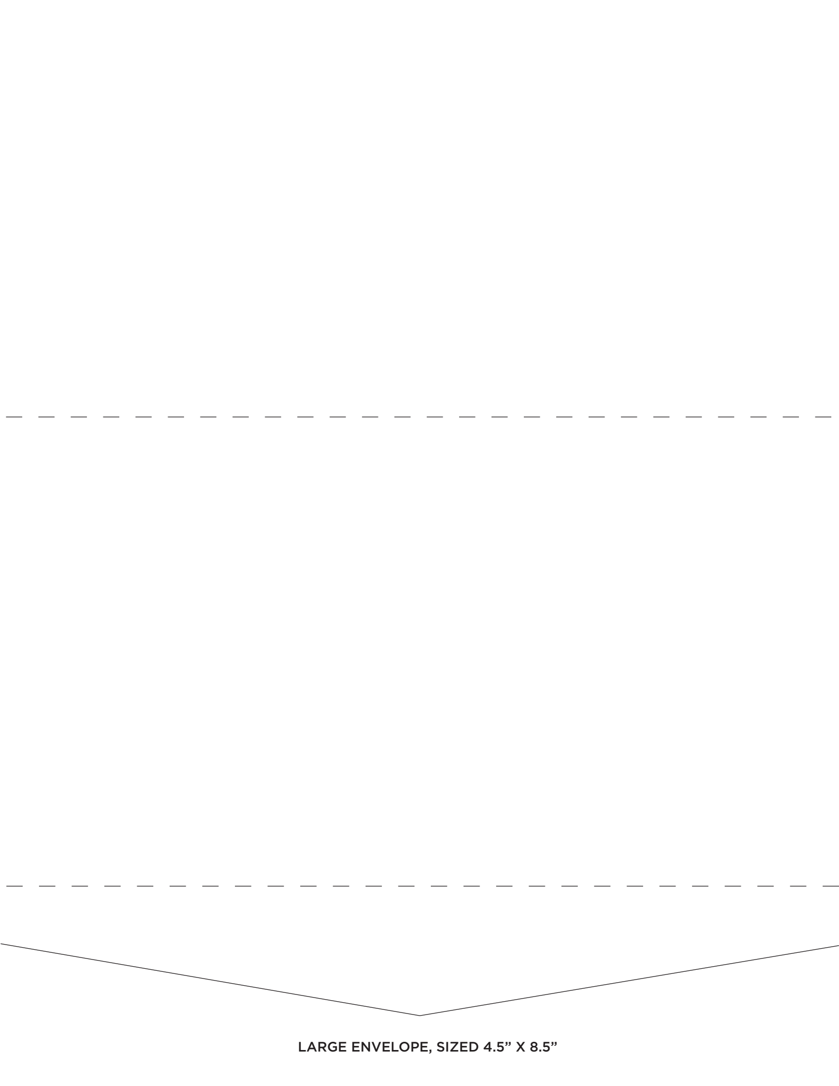
LARGE ENVELOPE, SIZED 4.5" X 8.5"